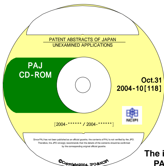
The image of new PAJ CD-ROM

We will change the labels of the PAJ's CD-ROM labels no and from. Below is those. Left-hand side is the PAJ CD-ROM and the other hand side is the PAJ Index CD-ROM.