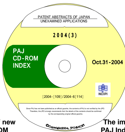
The image of new PAJ Index CD-ROM